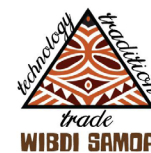
Women in Business Development Incorporated (WIBDI)

WIBDI was established in 1991 as the first non-governmental organisation of its kind in Samoa, with a commitment to finding income generating opportunities, especially in rural areas, emphasising women's leadership, families, youth and people with disability. WIBDI's approach to development stresses Samoan values, tradition and culture, sustainability, economic self-reliance and independence for the most vulnerable, and the importance of networks with communities, organisations, governments and international partners. The organisation brings a deep knowledge of the relationship between issues of gender and the nature of development and democracy within the Samoan cultural context, including the positive and negative sides of the evolving role of women since colonial times.