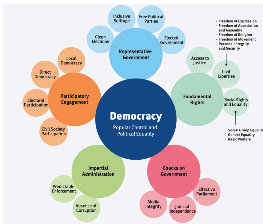
Figure I.1. The Global State of Democracy: Conceptual framework

Separate GSoD Indices are constructed for each attribute and subattribute (see Table I.1). The only exception is the fifth attribute, participatory engagement. This theoretical dimension is conceptually and empirically multidimensional and there are no obvious ways to aggregate its subattributes.